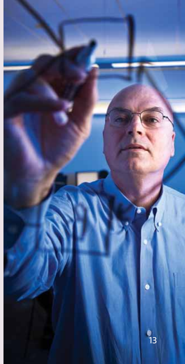
Erik Larson