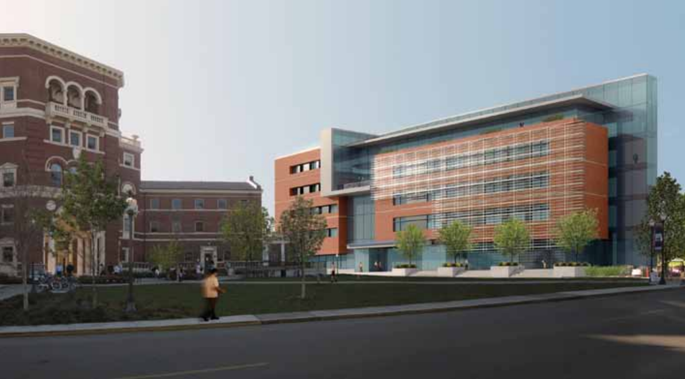
The new building, shown here as a conceptual representation, will contain classrooms, offices, student service areas, and collaborative learning spaces for the college's growing undergraduate and graduate programs.