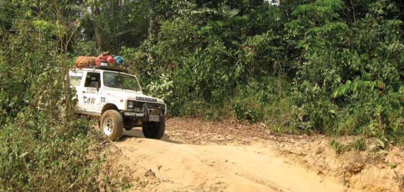
Tate Koenig and Keegan Warrington traveled in their small Suzuki through deserts and dirt roads for the Africa Rally.