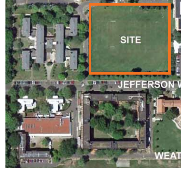
Future site of Austin Hall

Underlying the vision is the collective desire for the building to project a professional atmo-