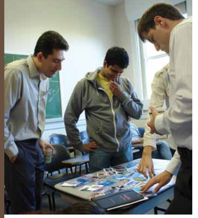
Dean's Student Leader Circle members are the pulse of the college and have an impact on important decisions. Here they participate in Impression Workshops for the new building, Austin Hall.