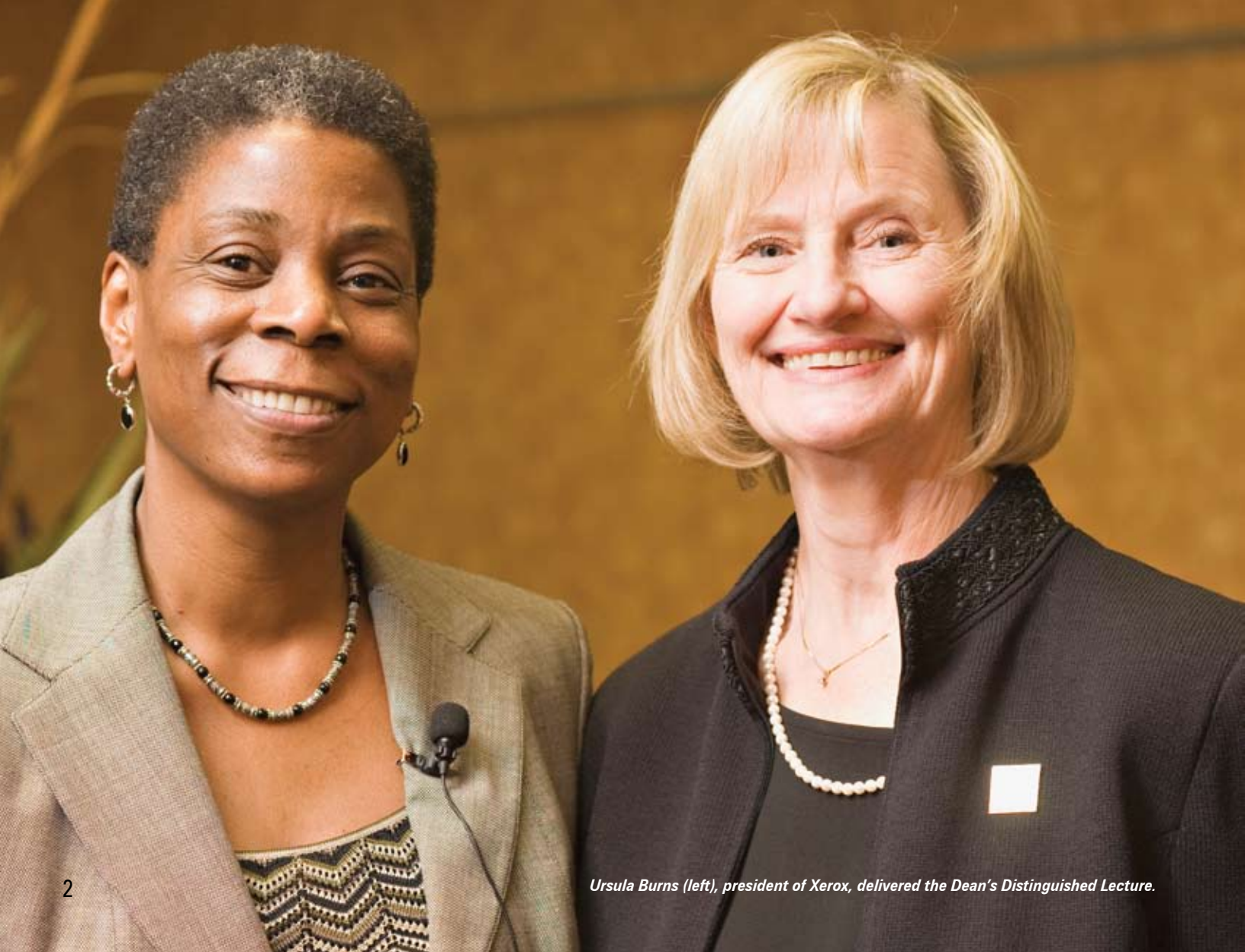
Ursula Burns (left), president of Xerox, delivered the Dean's Distinguished Lecture.